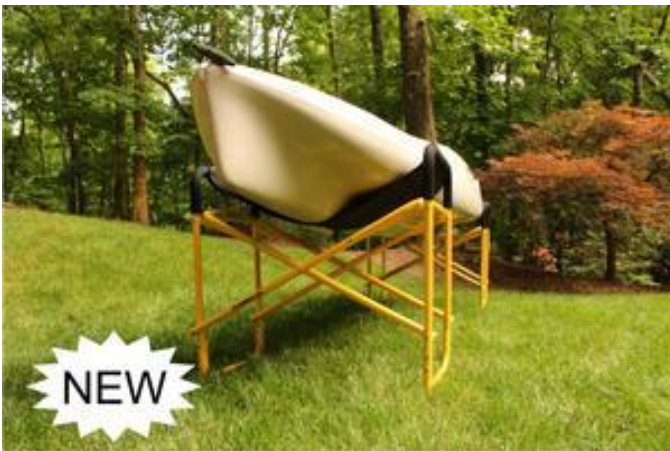
Suspenz Big Catch Work Station

Suspenz is introducing 2 products this year geared toward the ever-growing kayak fishing market. Their Big Catch Work Station allows sturdy access to large fishing kayaks both for storage and outfitting. And to accommodate the increasing number of “tunnel hull” boats that don’t fit traditional carts, they’ve introduced Big Yak Bumper Bars, which when used in conjunction with their Super Duty Mag-Lite Airless Cart (wow, that’s a mouthful!) will transport virtually any large kayak with ease.