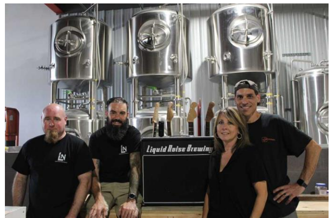
Liquid Noise Brewing

Things are happenin’ here in Marysville! Coming soon, our first Brew Pub; Liquid Noise Brewing. As the name suggests, they’re planning a music theme (hence the beer tap handles made of drumsticks, guitar heads, and microphones) and plan to offer not only a wide range of signature brews, but also food and entertainment in a family friendly atmosphere. We’re anxiously waiting their opening!