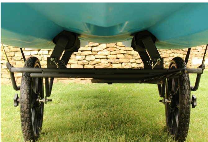
Suspenz BigYak Bumper Bars