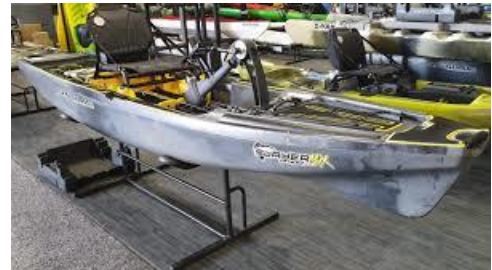
Slayer Propel 12.5 Max

Replacing the Slayer Propel 13 this year is Native Watercraft's Slayer 12.5 MAX, with optional "Sidekick" on-board cart, and upgraded seat, pedal drive, and rudder. The rockered bow aids in rising over waves, while a pronounced keel line maintains tracking. The boat is electronics, anchor, and motor ready for easy outfitting. $2599 ($2777 with Sidekick).