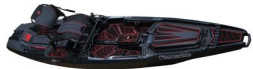
SS127 Black Widow