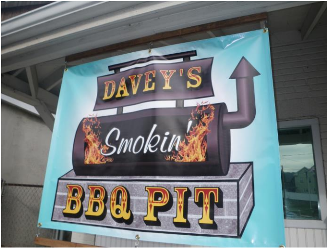
Davey's Smokin' BBQ Pit

Also coming soon, right across the street from BMO, Davey's Smokin' BBQ Pit ('cause you can't eat pizza EVERY day!)