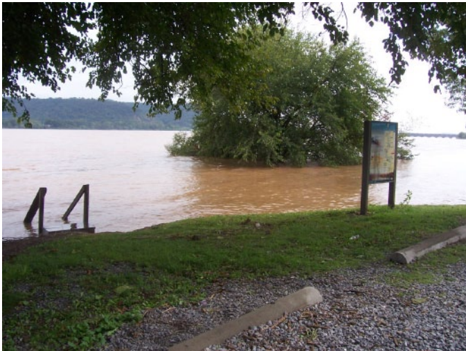
"High Water Mark"

Wow, do you think we had enough rain (and wind) this year? We've heard everything from "The Rapture" to "Armageddon"; personally would have gladly shipped at least half of the water down to Texas where they desperately needed it! Tornado, hurricane, tropical storm, 100 year flood (or two, or three), earthquake, and unprecedented October snowstorm...what could possibly be left? (Never mind, we don't want to know!)